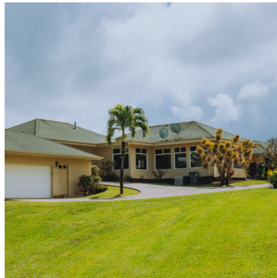
④ 1234 Address 3 bed, 3 bath, 2,000 sqft List price $900,000