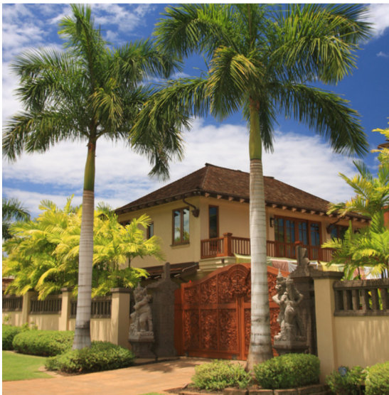
③ 1234 Address 3 bed, 3 bath, 2,000 sqft List price $900,000