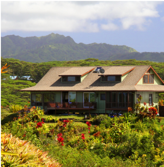
① 1234 Address 3 bed, 3 bath, 2,000 sqft List price $900,000