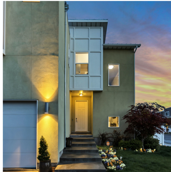
② 1234 Address 3 bed, 3 bath, 2,000 sqft List price $900,000